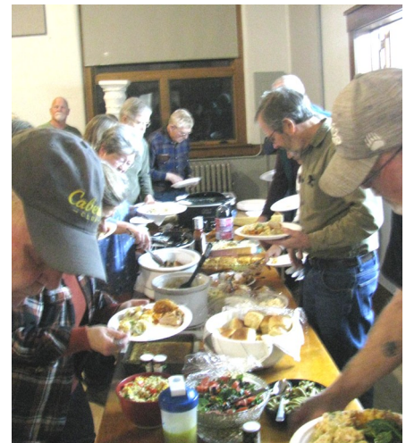
2024 at the Masonic Lodge