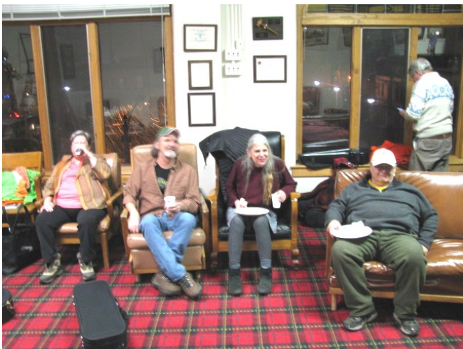
2020 at the Masonic Lodge