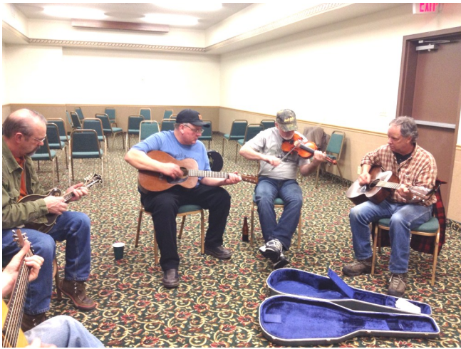
2013 at Ruby's

Believe it or not, we do not have any photos from the January/February winter jams to post for the newsletter. Instead, I thought you might enjoy some photos from winter jams in previous years.