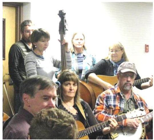
2015 at Ruby's