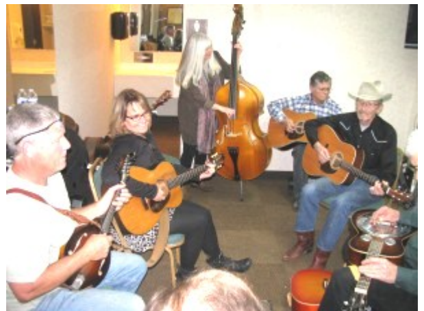
2016 at Ruby's