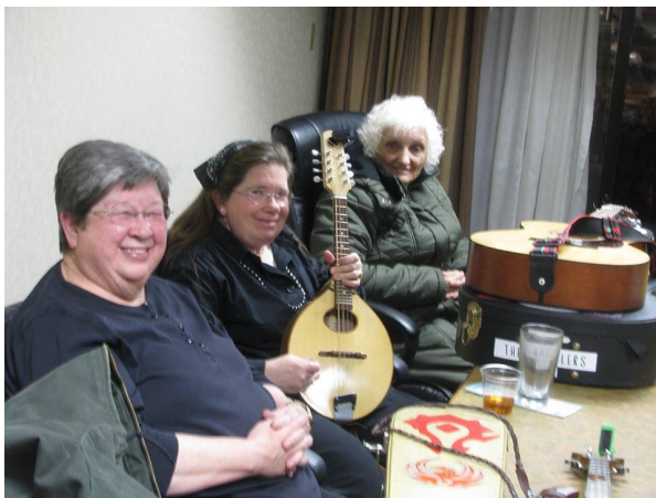
2018 at Ruby's