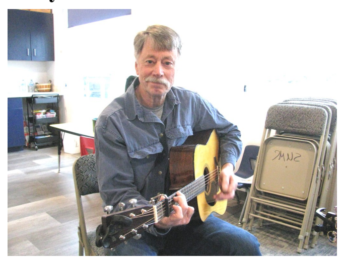
Sharing Music with the Guitar