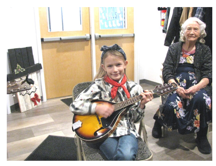
Sharing Music Between Generations