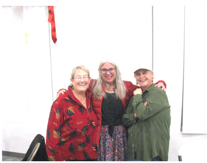
Sharing Music Among Friends