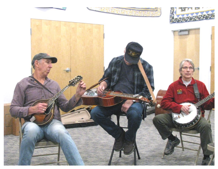
Sharing Music Before the Potluck