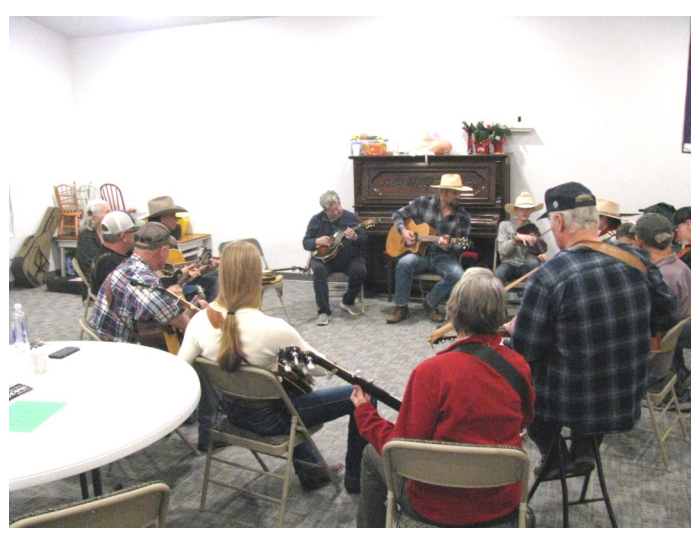
Sharing Music in the Jam Circle