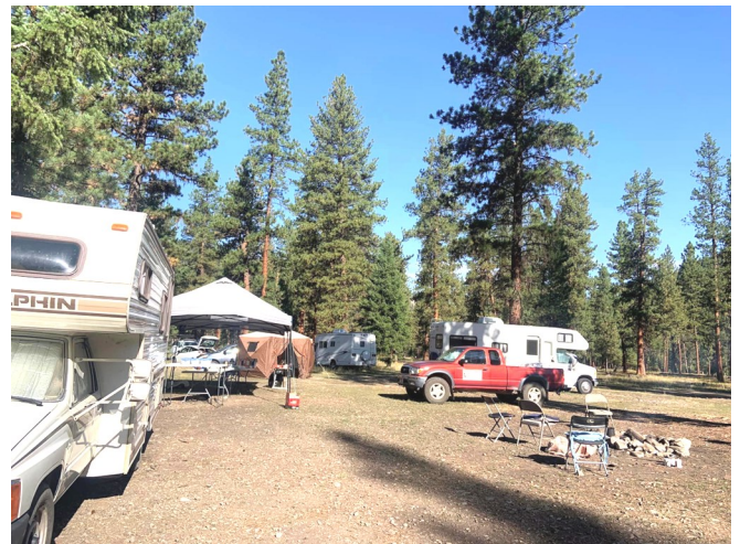
Waking up to Blue Skies