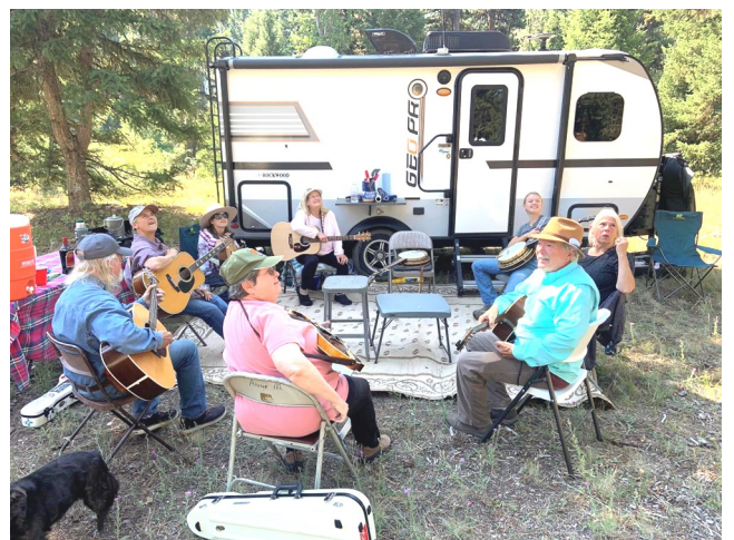
It's a Bird, it's a Plane, .....